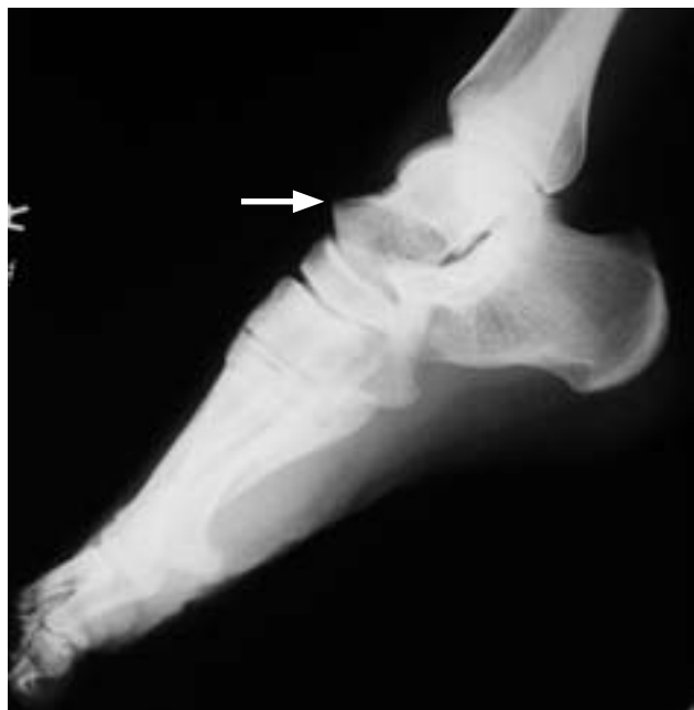
Figure 1 Lateral stress radiograph taken at maximum plantar flexion showing the dorsal thrust of the talar head at the talonavicular joint (arrow).

ultramarathon. The patient was an elite amateur runner, with a monthly training distance of 550 km and a best marathon time of 2.52 hours. He was diagnosed with acute tenosynovitis of the ankle dorsiflexors and was treated conservatively. Crepitation and triggering remained for more than 3 years and were exacerbated by intensive training. He did not respond to conservative treatment including oral non-steroidal anti-inflammatory drugs, taping, cast immobilisation, a functional orthotic insole, and