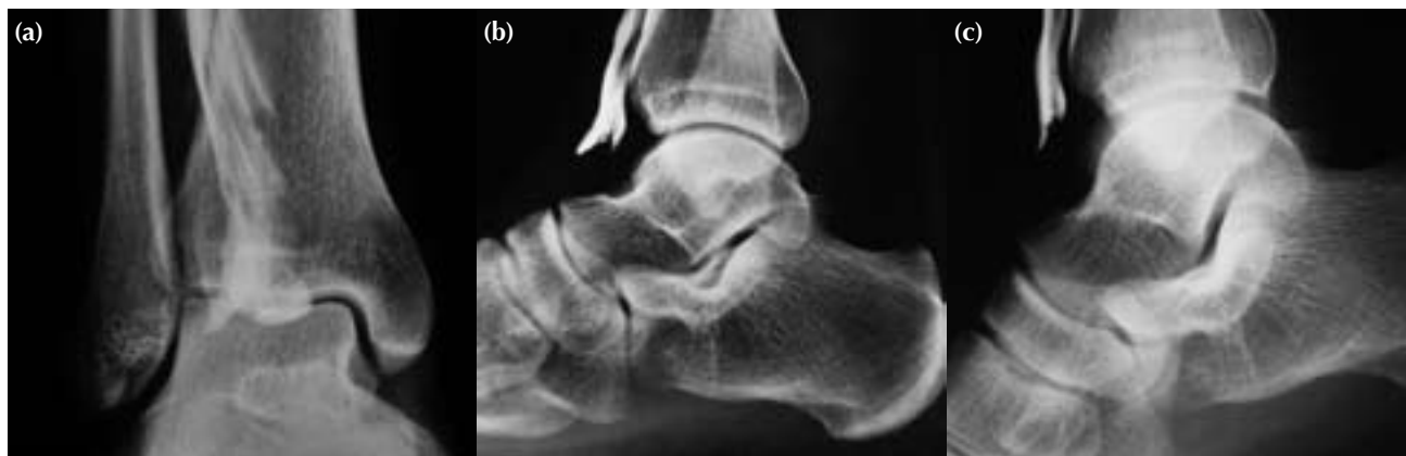
Figure 2 (a) Anteroposterior tenography showing irregular relief of the tendon sheath with an indentation and deficiency. (b) Lateral tenography taken at the neutral position showing tendon sheath stenosis at the level of the talonavicular joint. (c) Lateral tenography taken at 30° plantar flexion showing the anterior thrust of the talar head exacerbating the tendon sheath stenosis.

A 4-cm dorsolateral longitudinal incision was made at the talonavicular joint via an anterior approach. The inferior extensor retinaculum was attached to the extensor digitorum longus tendon. Tenolysis and excision of the talar head exostosis allowed this tendon to glide freely. No bowstringing of the tendon was seen postoperatively. The patient used crutches for the first 5 days after the operation and weight bearing was allowed as tolerated with early aggressive rehabilitation.